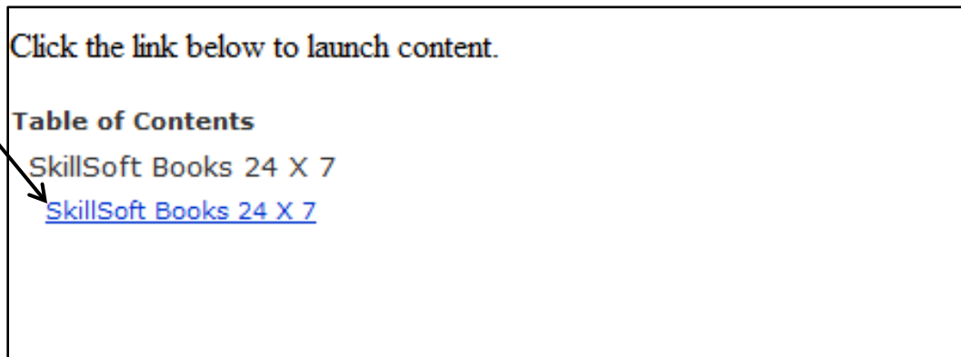
Figure 4 – SkillSoft Books 24 x 7 link for a sample Books 24x7 course

If you experience trouble with this process, please refer to the LMS Support Page .